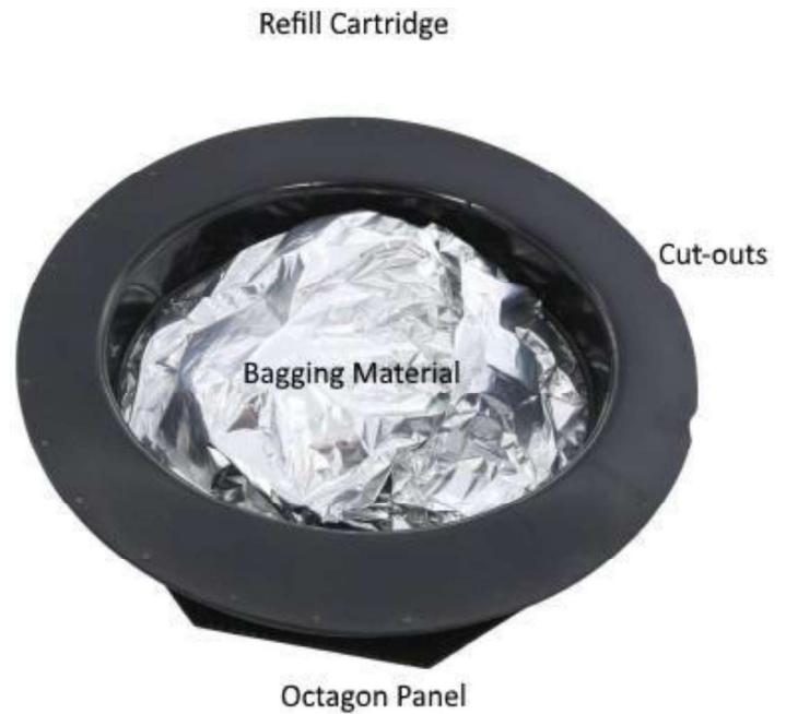
Laveo Front with Trim Top removed

The Octagon Container supplies rigid support to the liner and bagging material while waste is being stored within the Laveo. Simply lift the Octagon Container up, and remove it from the unit when you need to put a new liner in. The container should not come in contact with waste during normal usage, but if it does, you can clean the container with the cleaner of your choice.